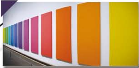
Video with A.C.E Technology

Better colour accuracy . . . . A.C.E Artificial.Color.Enhanced