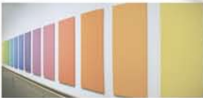
Conventional camera without A.C.E